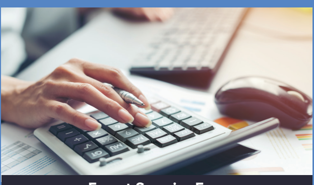
Forget Surprise Fees

Valerus' intuitive design overcomes the high demand for training and internal technical support when integrating a new system, allowing you to focus your resources on what's important. When integrated with VAX Access Control, the result is a complete security solution that allows you to visually verify access control events.